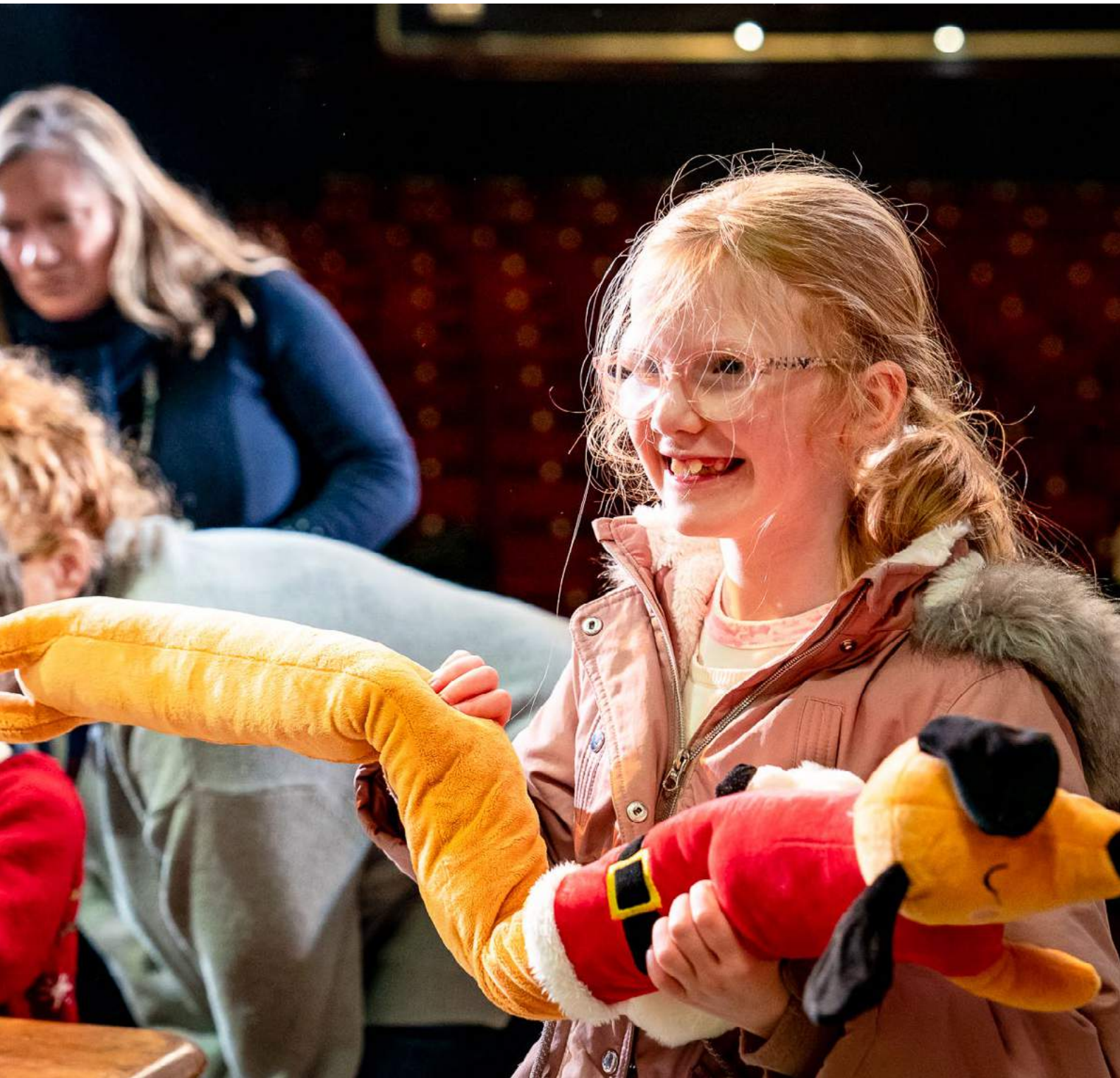
Image: Audio description is a key part of accessible theatre for adults but isn't common in children's theatre. With our funding, Wimbledon children's theatre, Polka Theatre, has been able to increase the number of audio-described performances on offer to visually impaired children and their families. It has also enabled them to share touch tours of their performances – as pictured here.